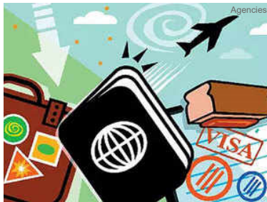
Some companies are, however, going slow on filing applications and waiting to file closer to the June 30 deadline.

Pune: Indian IT services providers are likely to press ahead with H-1B visa applications for the next fiscal year that starts in October, despite continuing uncertainty in the United States due to the coronavirus virus outbreak and the administration's anti-immigrant visa policies.