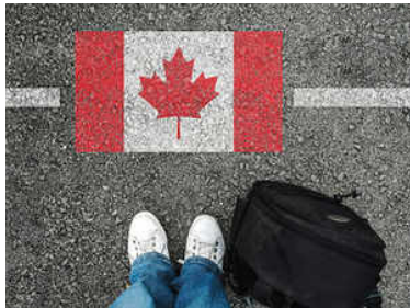
Nearly one third of the H-1B visa holders moving to Canada are Indians.

BENGALURU: With the Trump administration tightening regulations for H-1B visa holders in the United States, software professionals , mostly Indian, are making a beeline to Canada , said two people with direct knowledge of the people movement.